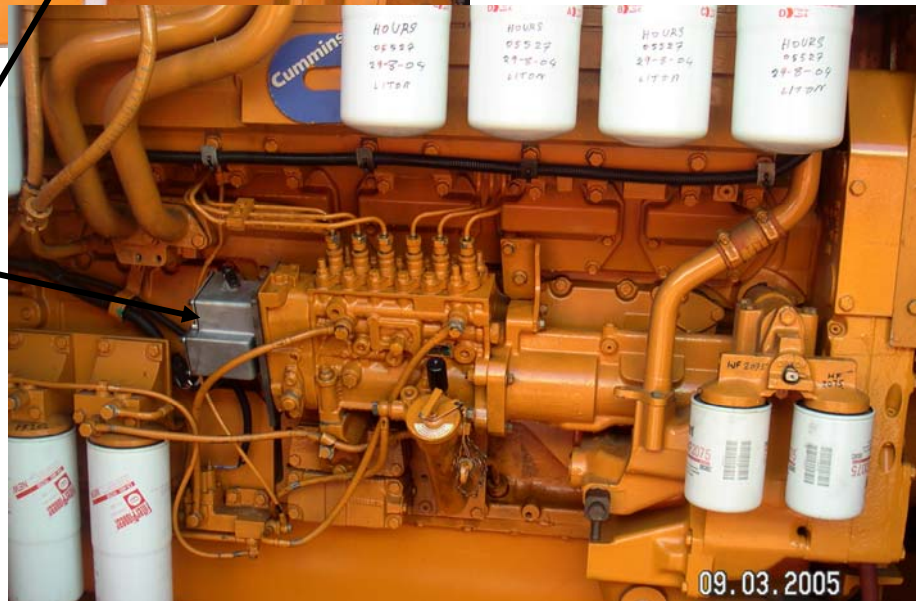
GAC Integral Actuator ACD-175AF-HT-24

Solutions for combustion engines, that work right from the beginning.