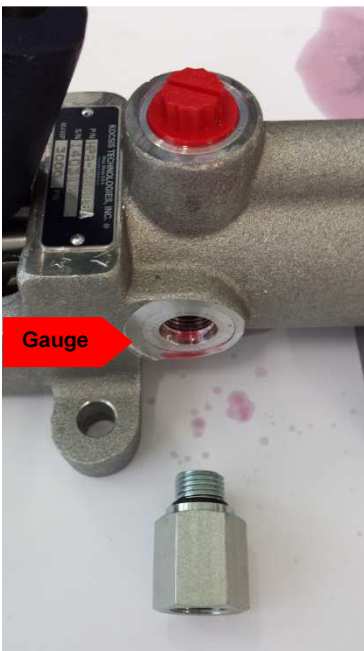
Fig. 3: Adapter SAE 4 to 1/4" NPTF for Gauge port.