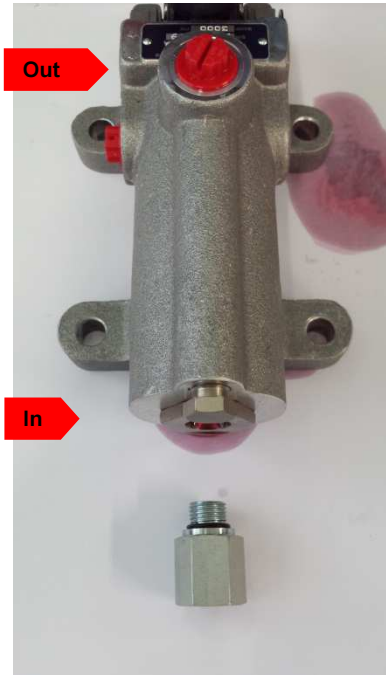
Fig. 1+2: Adapter SAE 6 to 3/8" NPTF for In-/Outlet ports (for stand-alone HPA).