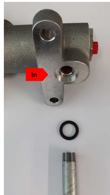
Fig. 4: Inlet tube SAE 6 with O-Ring for Inlet (for HPA mounted on CPS reservoir).